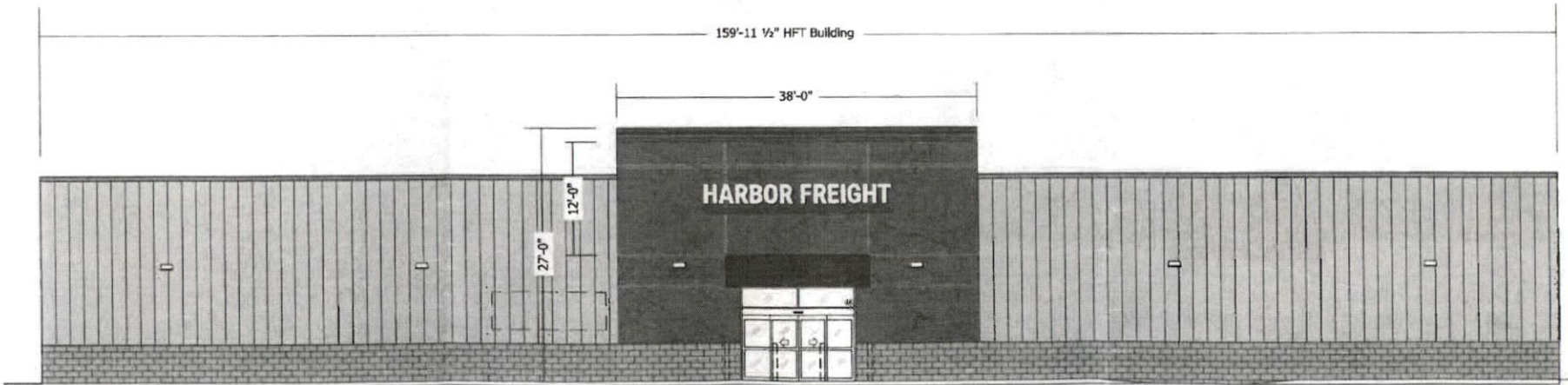
North Elevation - Scale: 3/32" = 1'-0"