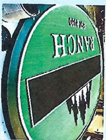
Example Of Dimensional Routing