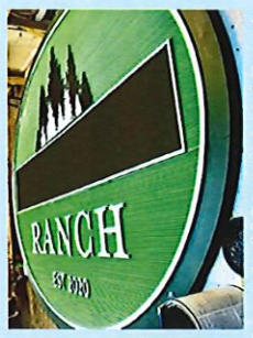
Example Of Dimensional Routing