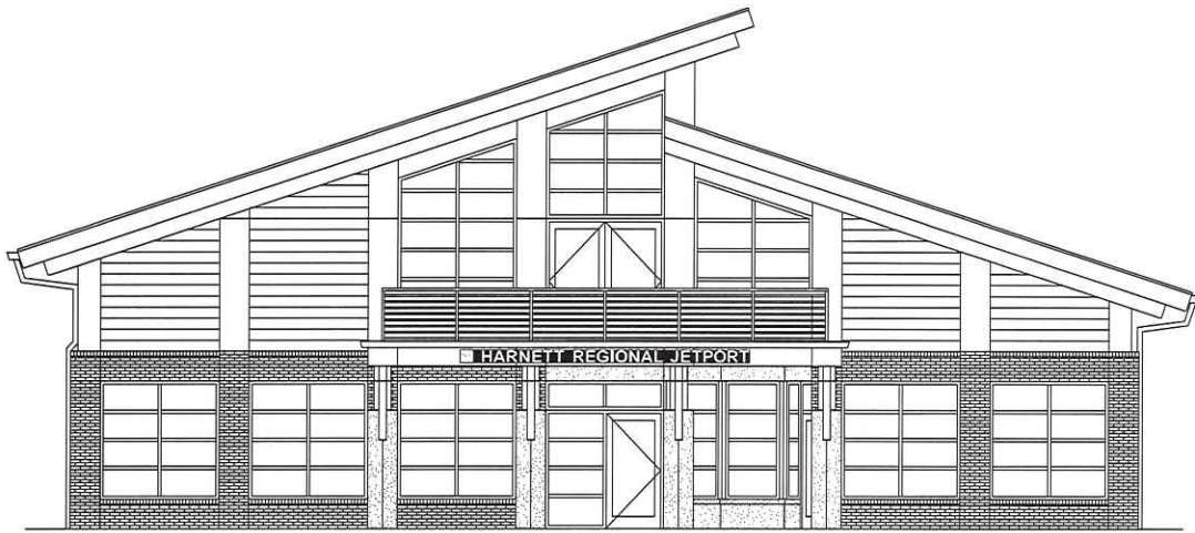
ARCHITECTURAL REAR ELEVATION