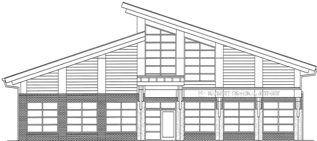
ARCHITECTURAL FRONT ELEVATION