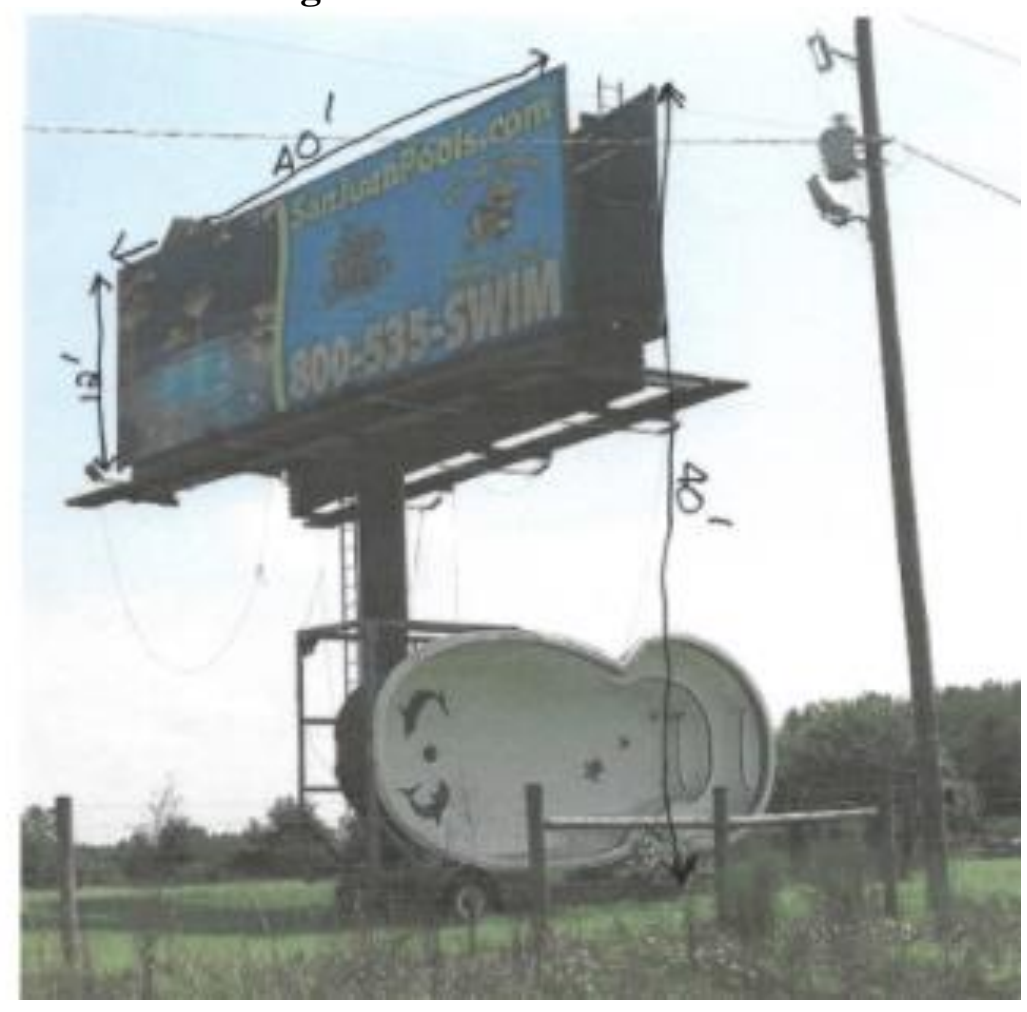
Planning Services Sign Permit Review Form