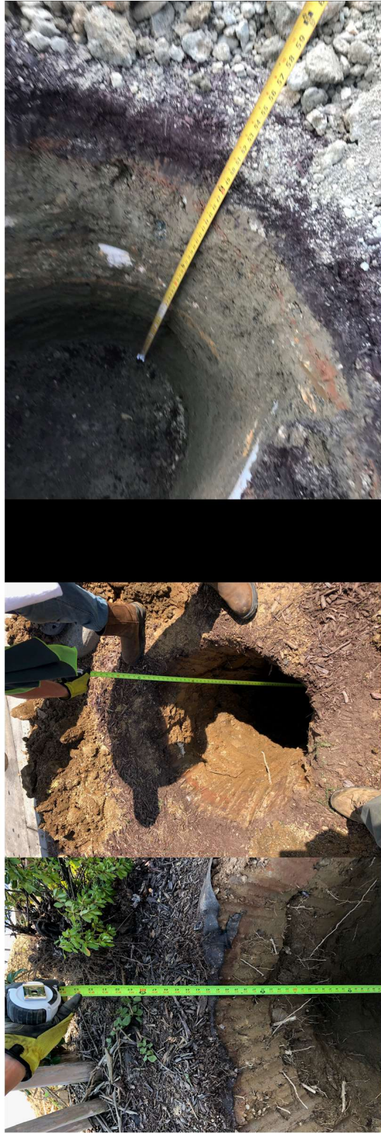
Site Photographs Provided For Review