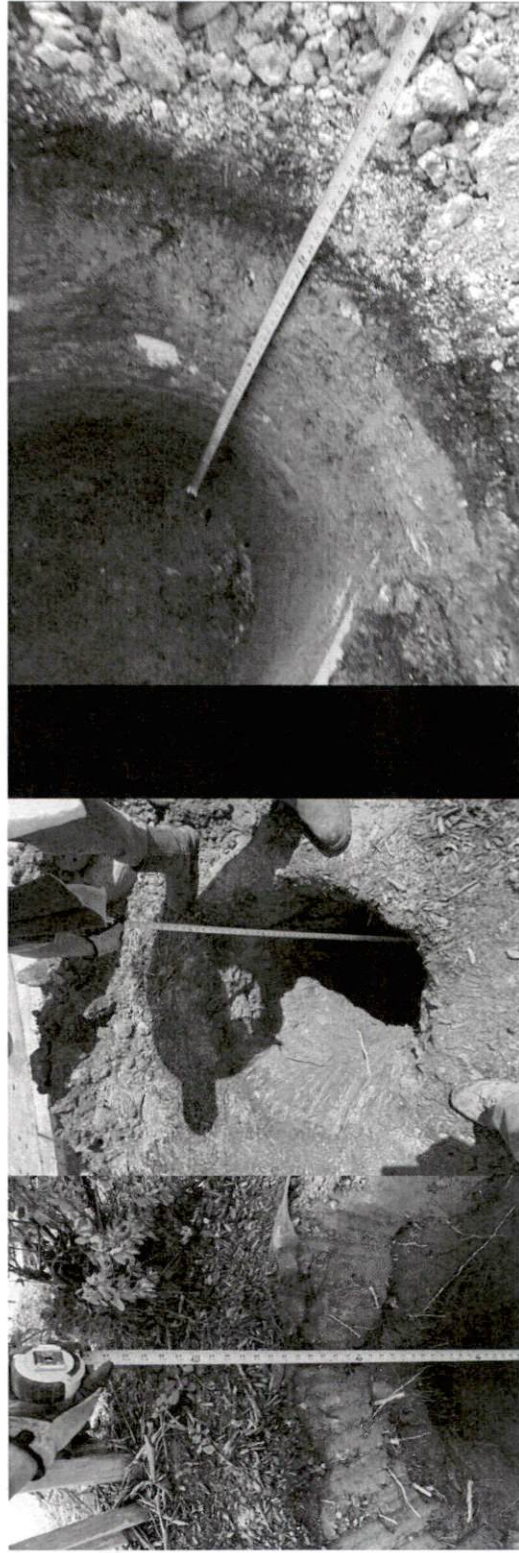
Site Photographs Provided For Review