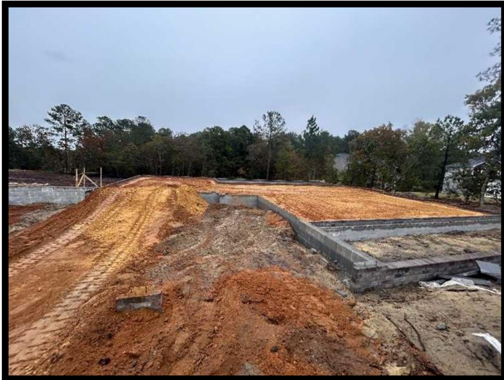
Lot 34 Stem Wall