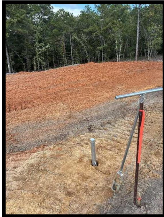
SW Corner (1)