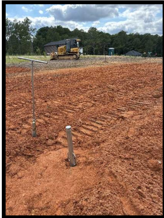
NE Corner (3)