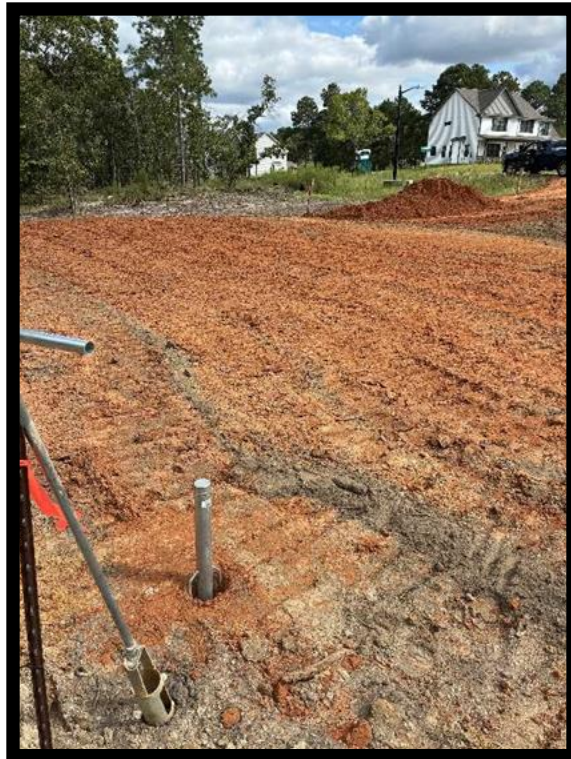
NW Corner (2)