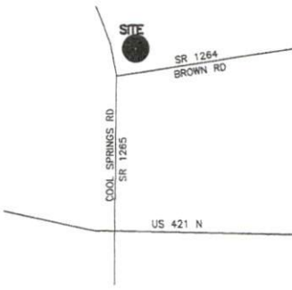
VICINITY MAP (NTS)