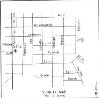
VICINITY MAP (Not to Scale)