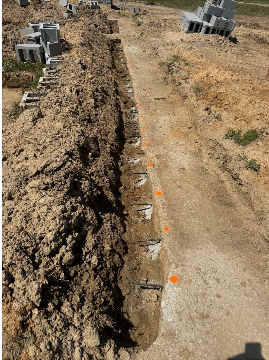
Additional example of repairs completed