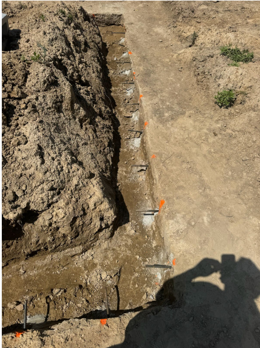
Example of repairs completed