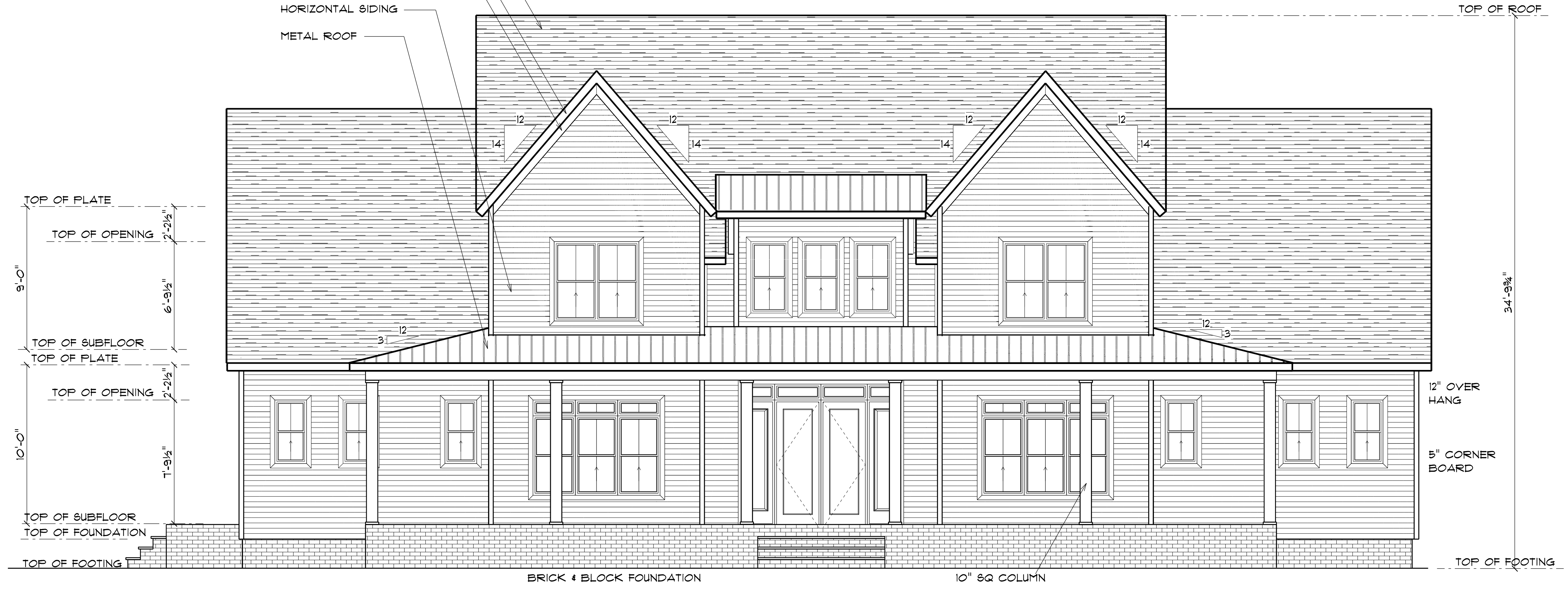
FRONT ELEVATION SCALE: 1" = 1/4"