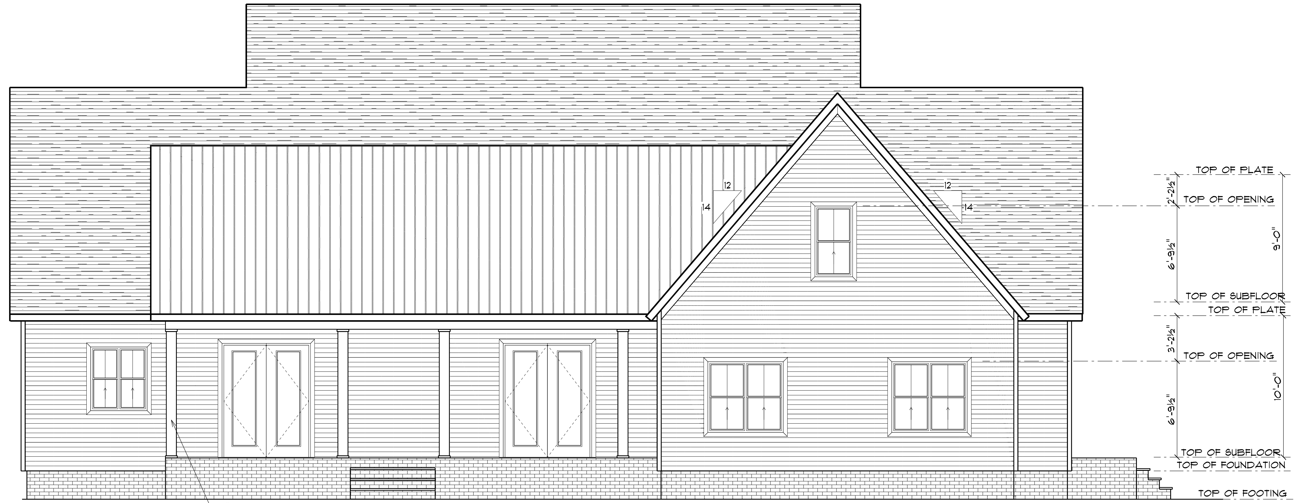
REAR ELEVATION SCALE: 1" = 1/4"