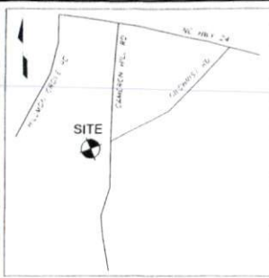
Vicinity Map (Not to Scale)