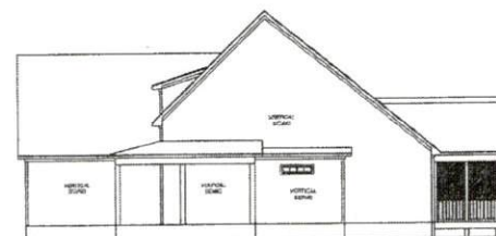
RIGHT ELEVATION 1/8" = 1'-0"