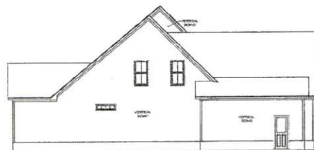
LEFT ELEVATION 1/8" = 1'-0"