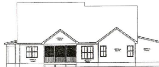
REAR ELEVATION 1/8" = 1'-0"