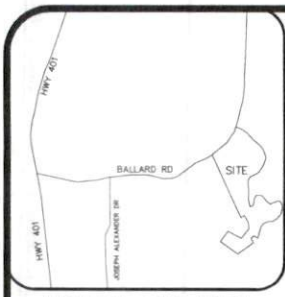
VICINITY MAP (NTS)

SETBACKS PER PB 2024 PG 325-330 ZONE-RA30/RA-20M FRONT 25'/20' SIDE 10'/5' REAR 20'/15' SIDE STREET 20'/15'