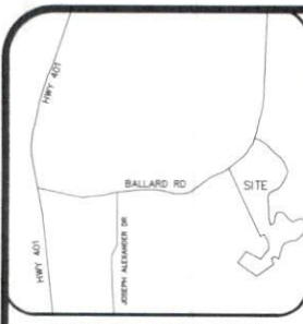
VICINITY MAP (NTS)

SETBACKS PER PB 2024 PG 325-330 ZONE-RA30/RA-20M FRONT 25'/20' SIDE 10'/5' REAR 20'/15' SIDE STREET 20'/15'