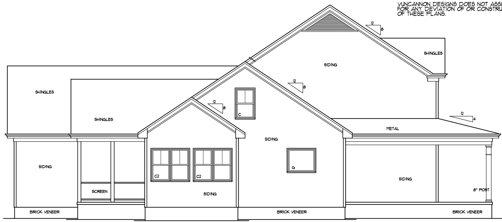
LEFT SIDE ELEV SCALE: 1/4" = 1'-0"