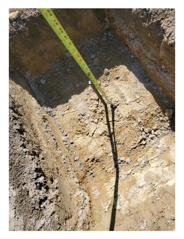
Page 4 of 5