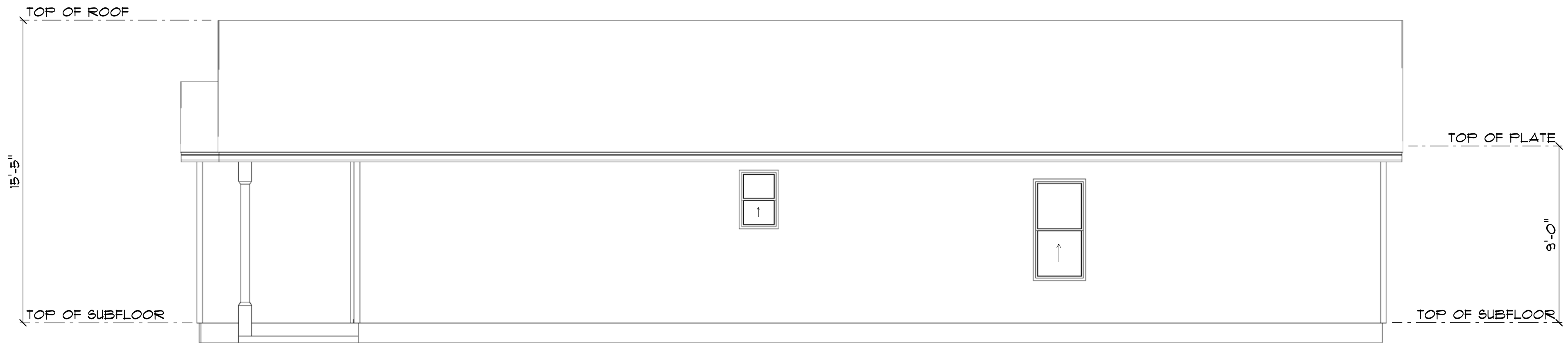
Right Elevation SCALE: 1/4" = 1'-0"