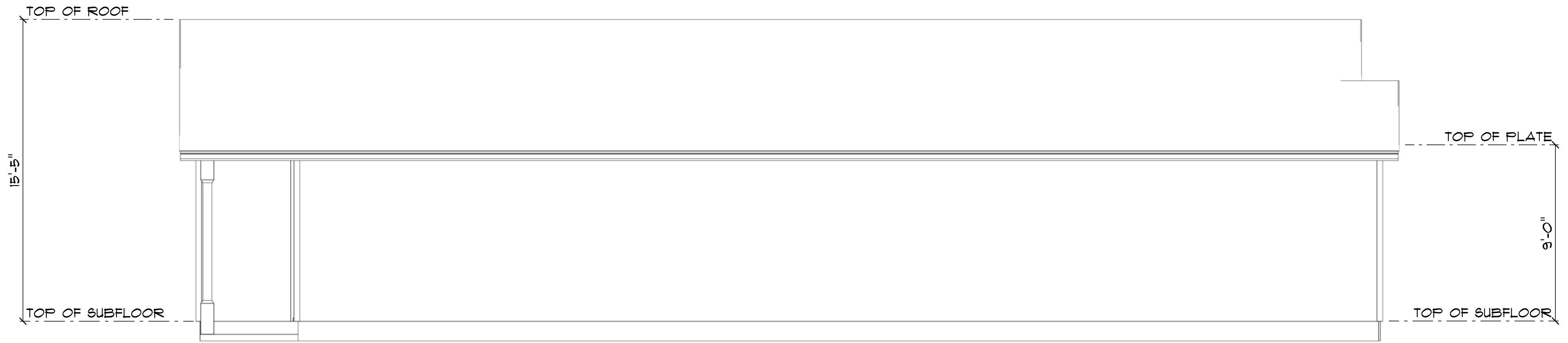
Left Elevation SCALE: 1/4" = 1'-0"