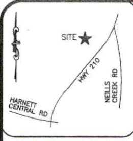
VICINITY MAP (NTS)