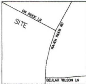
VICINITY MAP N.T.S.