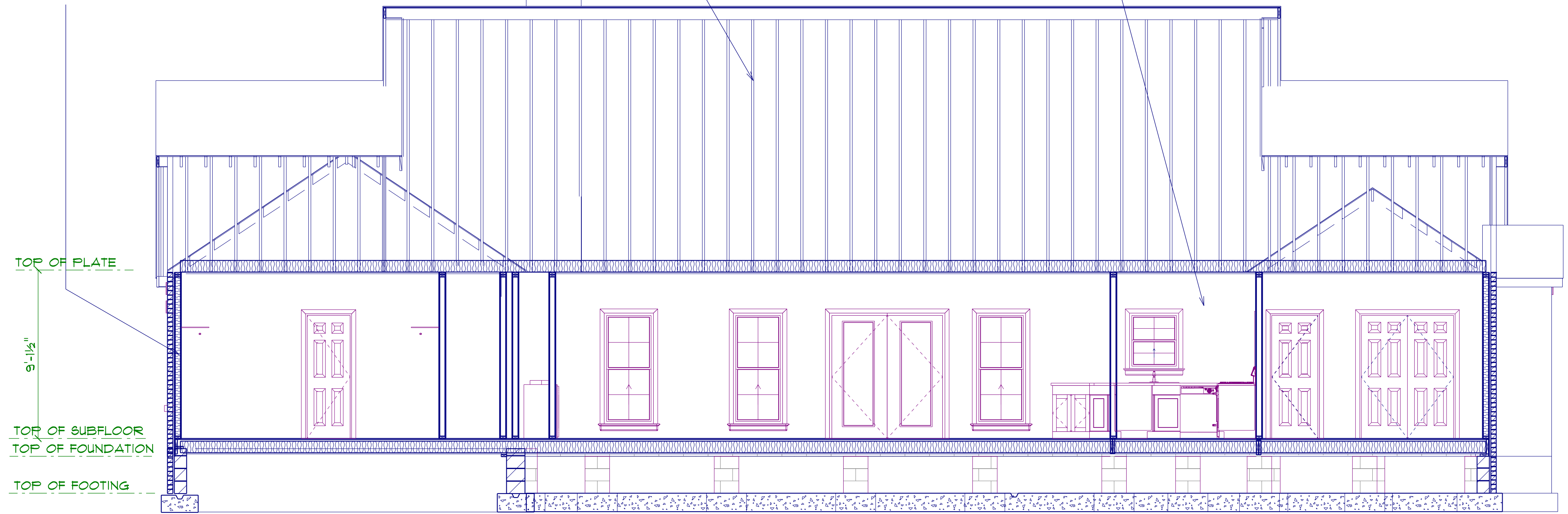
SECTION THROUGH SCALE: 1" = 1/4"

TYPICAL 2x4 WALL: 1/2" DRYWALL TAPED & SANDED 2x4 STUDS @ 16" o.c. 1/2" DRYWALL TAPED & SANDED