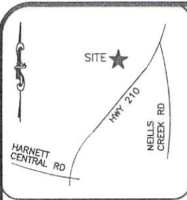
VICINITY MAP (NTS)