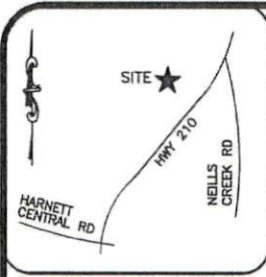
VICINITY MAP (NTS)

SETBACKS PER BK 2022 PGS 276-289 FRONT 35' SIDE 10' REAR 20' SIDE STREET 20' MAX BLDG HGT 35' ZONING: RA-30