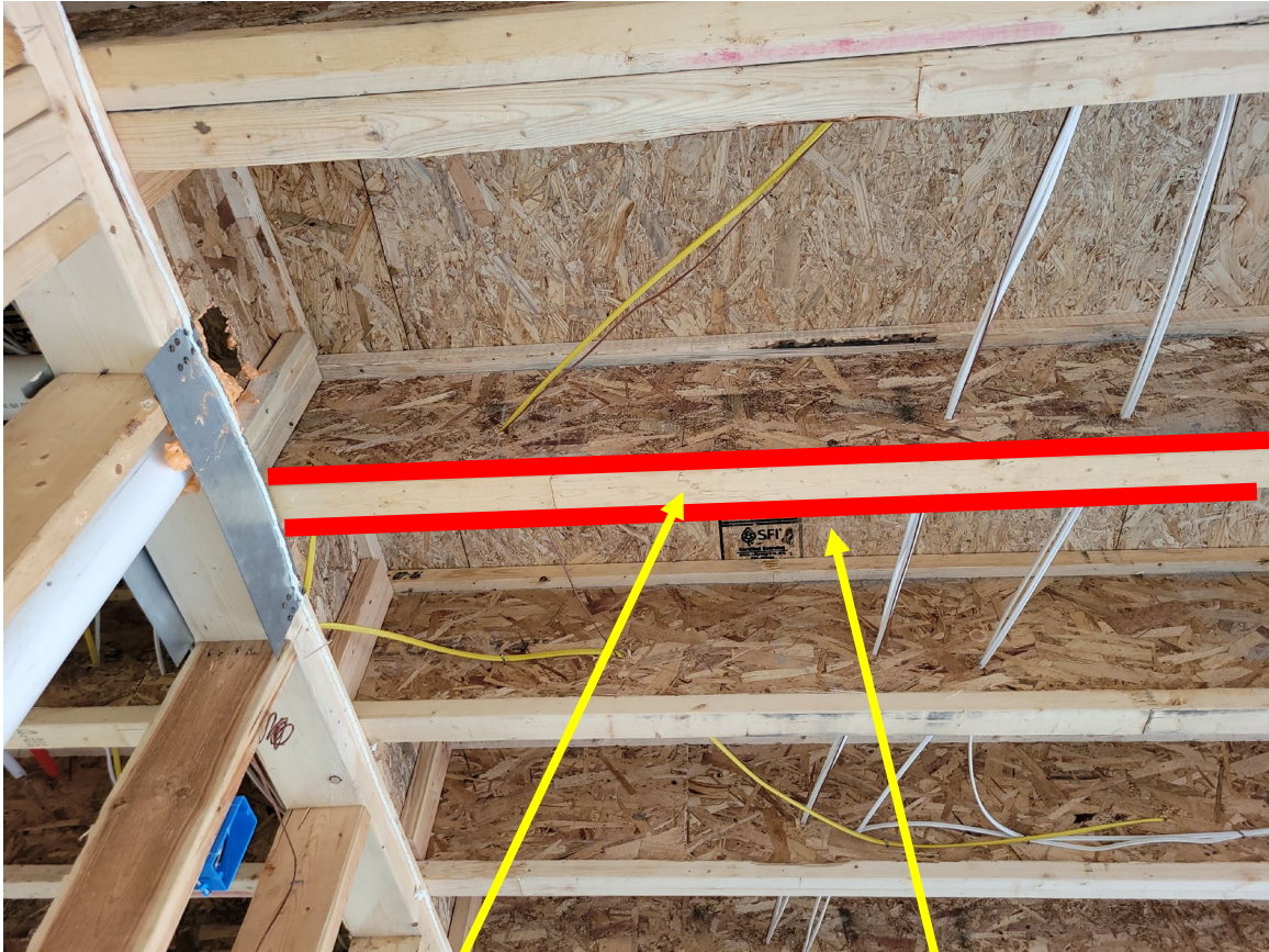
Damaged Flange and approximate location of scabs