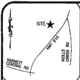
VICINITY MAP (NTS)

SETBACKS PER: BK 2022 PGS 278-289 FRONT 35' SIDE 10' REAR 20' SIDE STREET 20' MAX BLDG HGT 35' ZDNG: RA-30