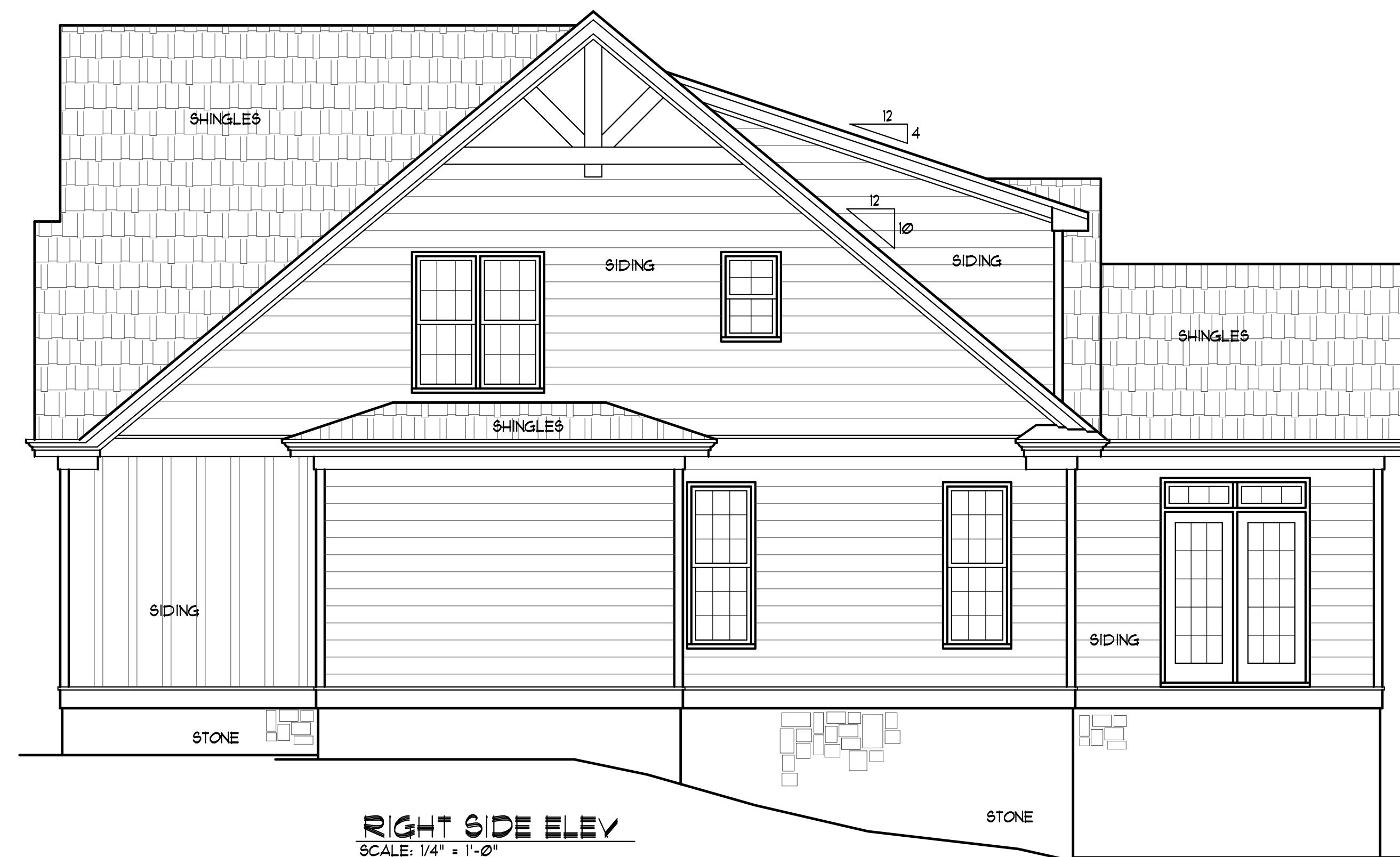
RIGHT SIDE ELEV SCALE: 1/4" = 1'-0"

Aristide, Tom and Cathy 1008 Joe Collins Road Lillington, NC