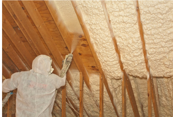
Figure 2. Application of EasySeal .5 Spray Foam Insulation in an Unvented Attic