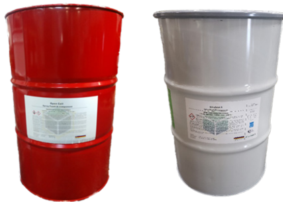
Figure 1. EasySeal .5 Isocyanate (A-Side) and Resin (B-Side)

2.1 The innovative product evaluated in this report is shown in Figure 1 and Figure 2 .