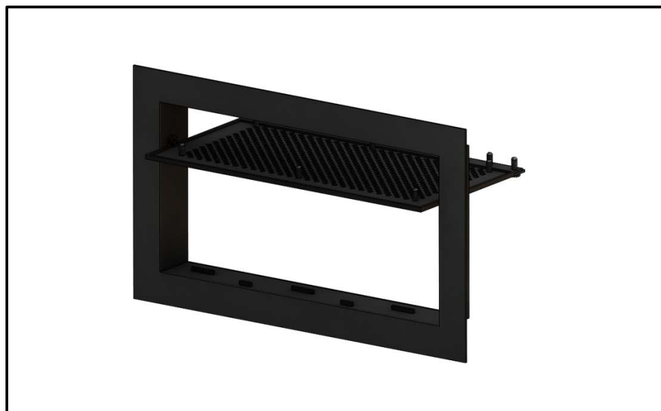
FIGURE 2—MODEL FFV-1608 FREEDOM FLOOD VENT™: SHOWN WITH FLOOD DOOR PIVOTED OPEN