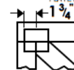
PLATE LOCATION AND ORIENTATION

Center plate on joint unless x, y offsets are indicated. Dimensions are in ft-in-sixteenths (x-x-x). Apply MPCs to both sides of Truss and fully embed teeth.