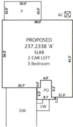
INSET SCALE: 1"=20'

PIN: 0652-05-5666.000 TOTAL LOT AREA = 0.52 AC = 21,883 SF HOUSE = 1,415 SF PORCH = 75 SF SIDEWALK = 34 SF DRIVEWAY = 700 SF PATIO = 200 SF AC PAD = 9 SF PROPOSED IMPERVIOUS = 2,433 SF PERCENT IMPERVIOUS = 11.11% MAXIMUM ALLOWED IMPERVIOUS = 4,000 SF