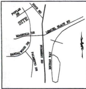
VICINITY MAP (NO SCALE)

N/F WELLCO CONTRACTORS, INC DB 863, PG 792