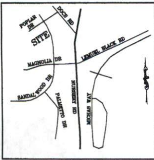
VICINITY MAP (NO SCALE)

N/F WELCO CONTRACTORS, INC DB 863, PG 792