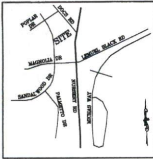
VICINITY MAP (NO SCALE)