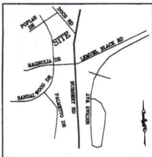
VICINITY MAP (NO SCALE)

NOTE : CONTRACTOR TO VERIFY ALL BUILDING SETBACKS PRIOR TO CONSTRUCTION.