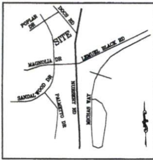
VICINITY MAP (NO SCALE)

NOTE : CONTRACTOR TO VERIFY ALL BUILDING SETBACKS PRIOR TO CONSTRUCTION.