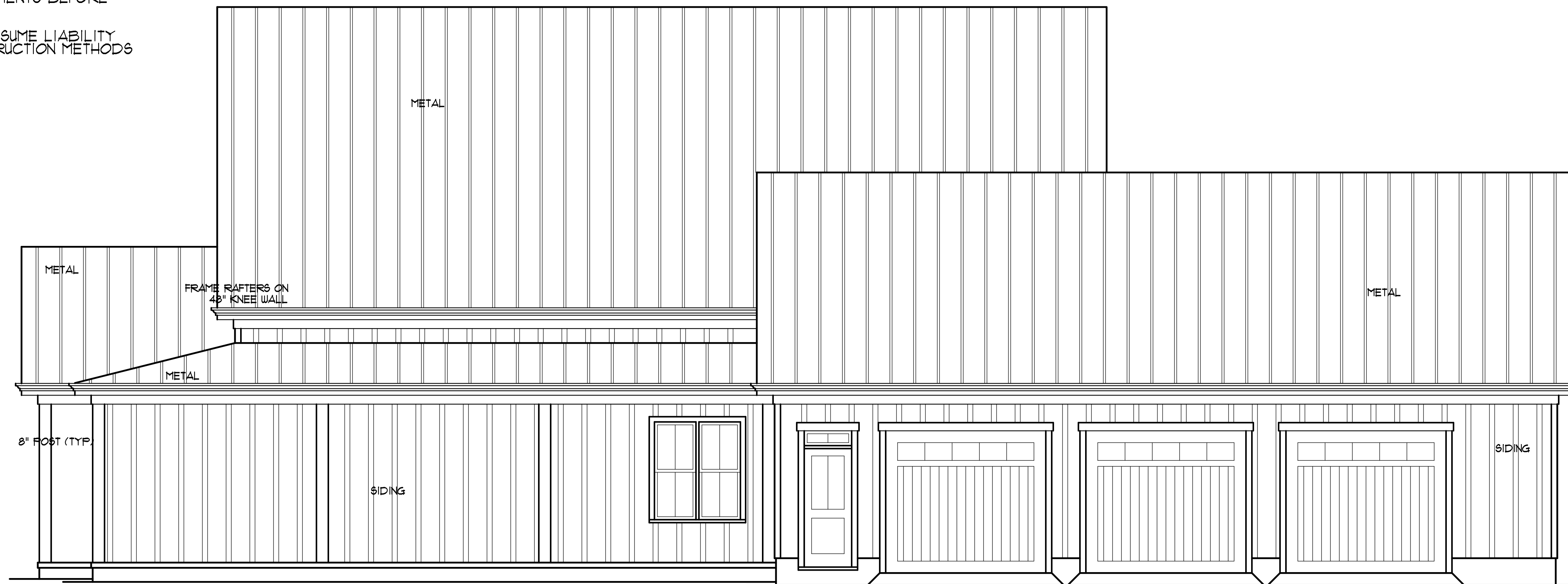
RIGHT SIDE ELEVATION SCALE: 1/4" = 1'-0"

YUNCANNON DESIGNS DOES NOT ASSUME LIABILITY FOR ANY DEVIATION OF OR CONSTRUCTION METHODS OF THESE PLANS.