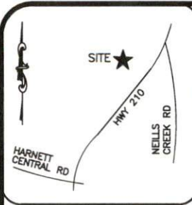
VICINITY MAP (NTS)