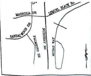
VICINITY MAP (NO SCALE)