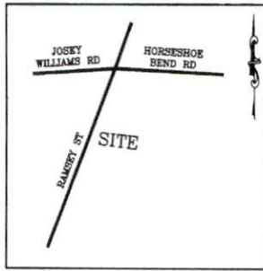
VICINITY MAP (NO SCALE)