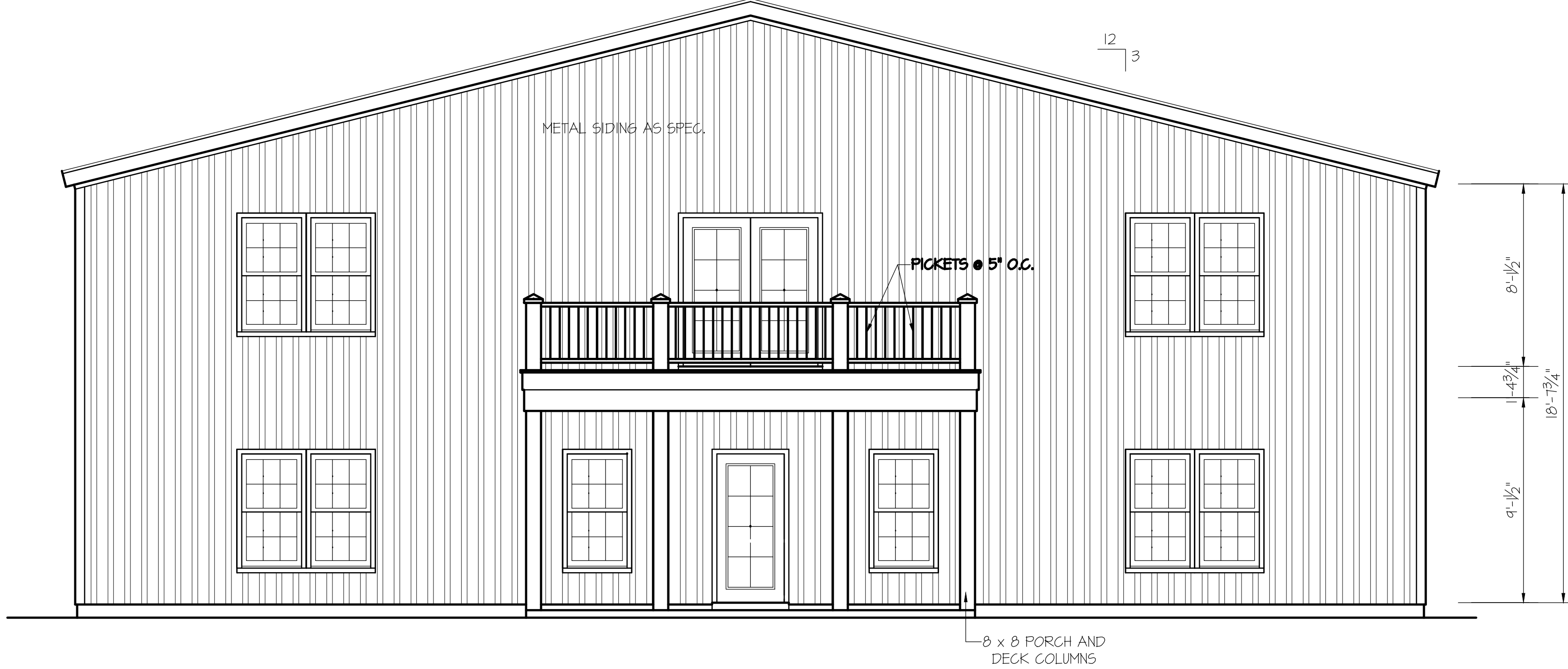
(LIVING QUARTERS OF 60' x 100' BUILDING) FRONT ELEVATION SCALE: 1/4" = 1'-0"

DISK FILE NO. C.F. - " EDWARD GAINER " - FEB.-2022