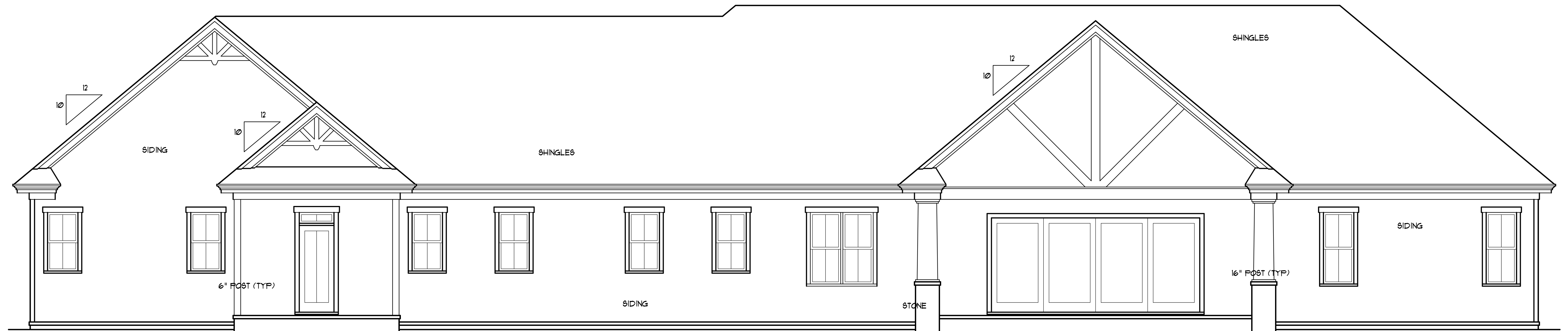
REAR ELEVATION SCALE: 1/4" = 1'-0"

YUNCANNON DESIGNS DOES NOT ASSUME LIABILITY FOR ANY DEVIATION OF OR CONSTRUCTION METHODS OF THESE PLANS.