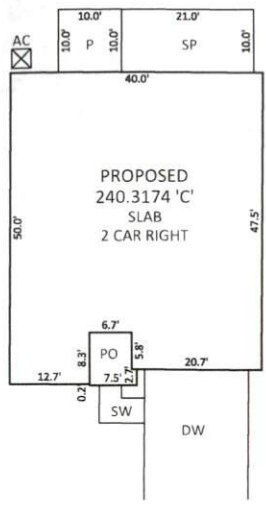
INSET SCALE: 1"=20'

PIN: 0642-94-7049.000 TOTAL LOT AREA = 0.583 AC = 25,400 SF HOUSE = 1,893 SF PORCH = 59 SF SIDEWALK = 36 SF DRIVEWAY = 640 SF PATIO = 100 SF SCREENED PATIO = 200 SF AC PAD = 9 SF PROPOSED IMPERVIOUS = 2,937 SF PERCENT IMPERVIOUS = 11.6 % MAXIMUM ALLOWED IMPERVIOUS = 4,000 SF