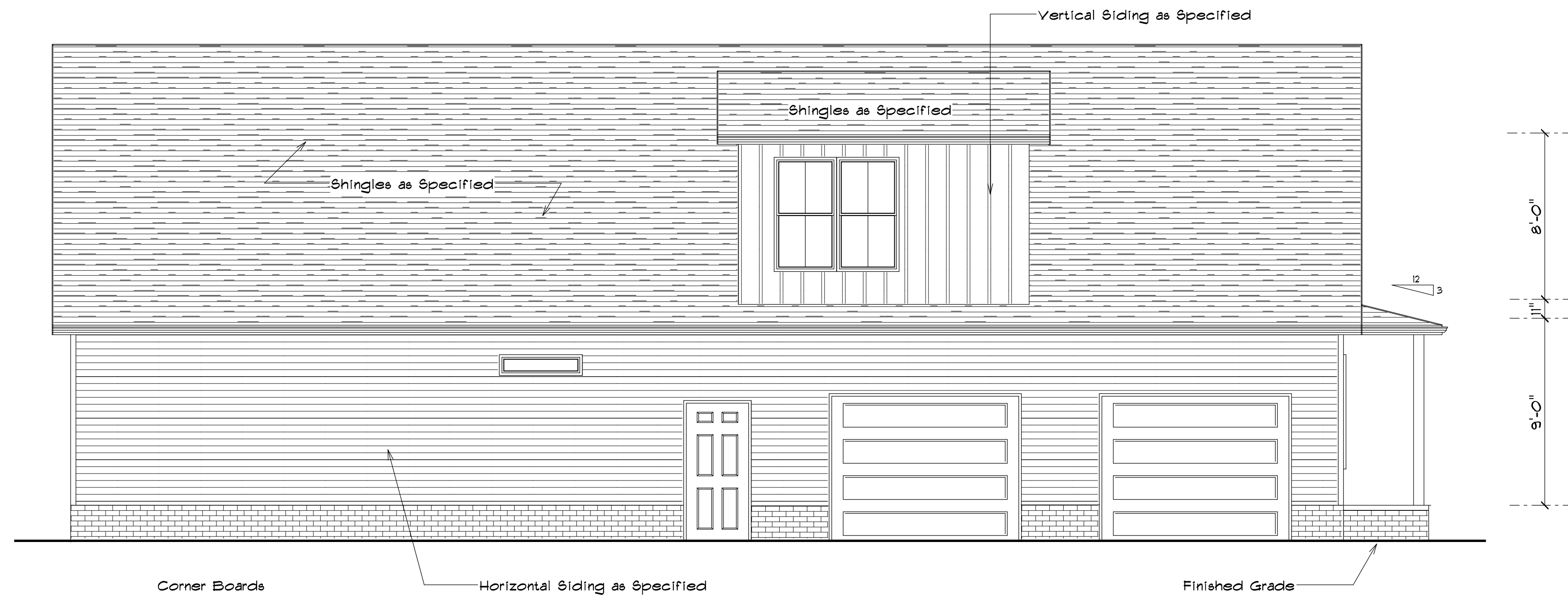
LEFT ELEVATION SCALE: 1/4" = 1'-0"