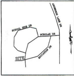
VICINITY MAP (NO SCALE)