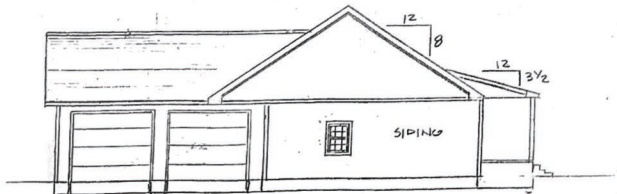
3 5-1 LEFT SIDE ELEVATION SCALE 1/8" = 1'-0"