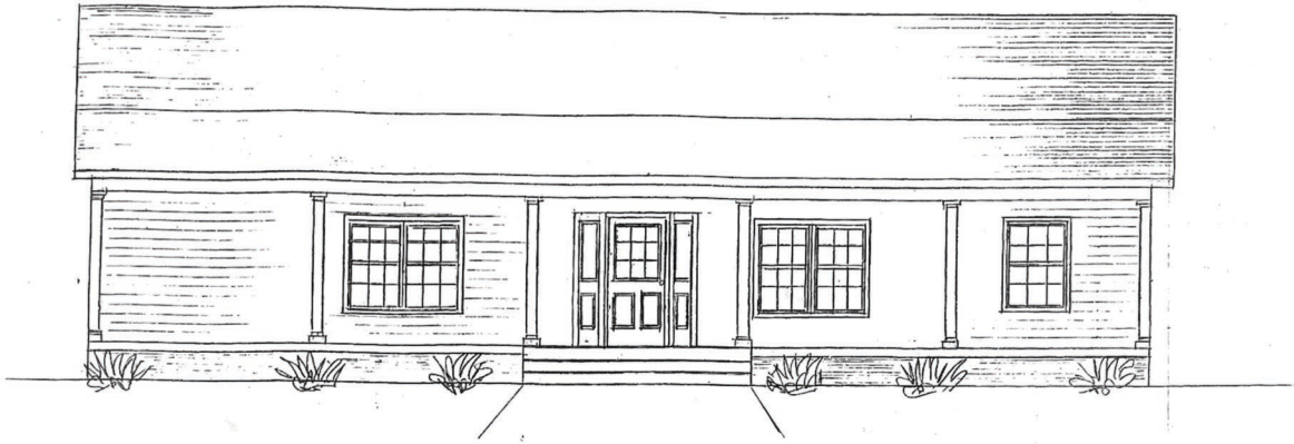
1 5-1 FRONT ELEVATION SCALE 1/4" = 1'-0"