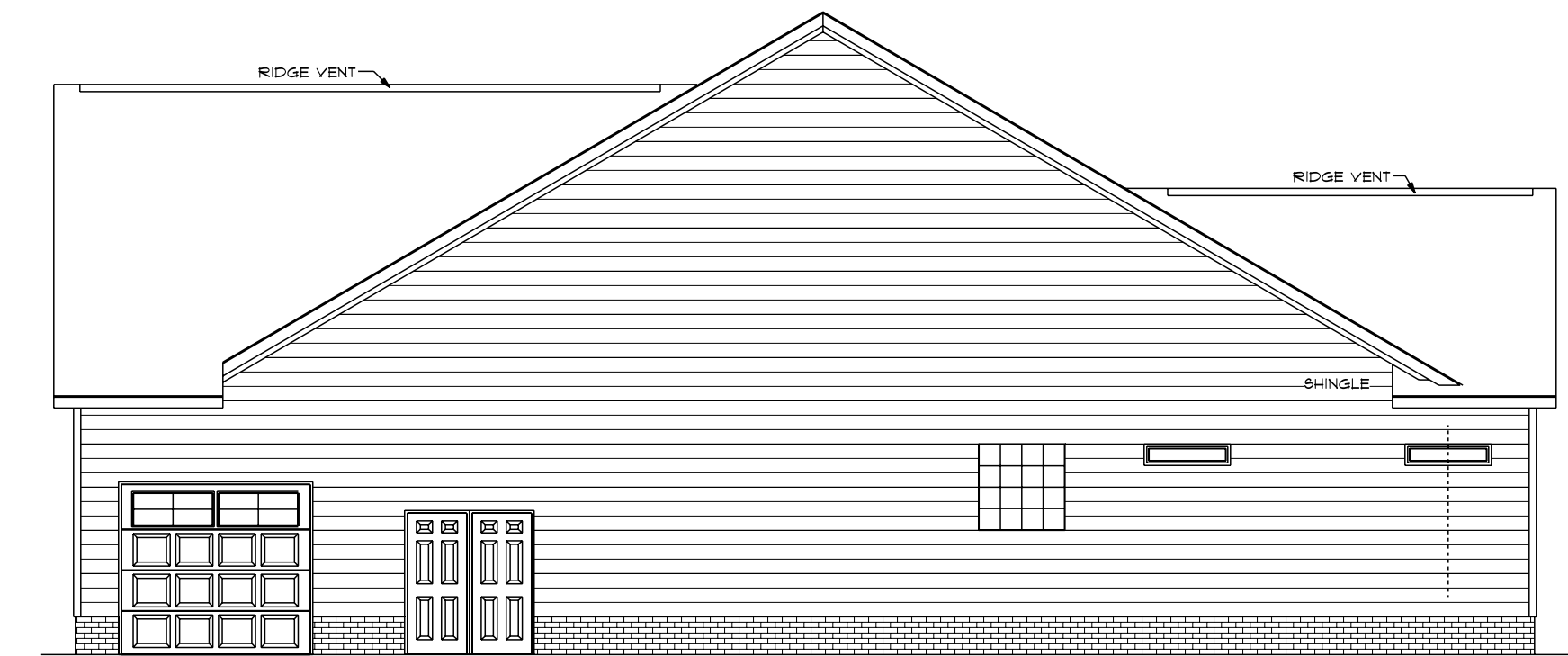
RIGHT ELEVATION SCALE: 1/8" = 1'0"