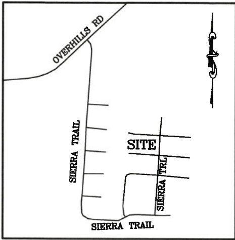
VICINITY MAP (NO SCALE)